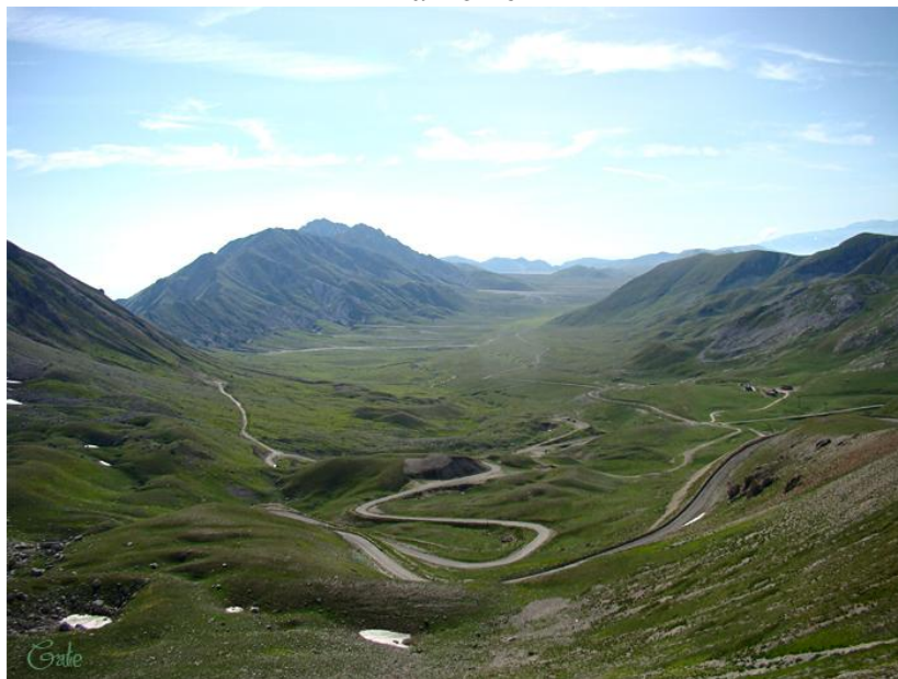
Campo Imperatore: paradise!