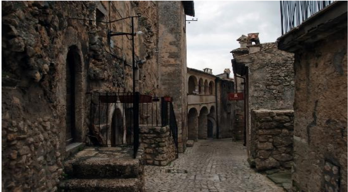
The medieval village of Santo Stefano di Sessanio

Santo Stefano di Sessanio - Gran Sasso National Park - Campo Imperatore