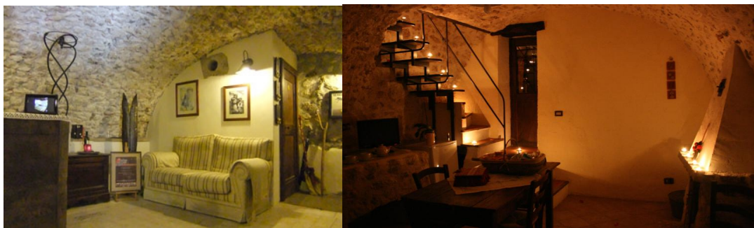
Residenza La Torre