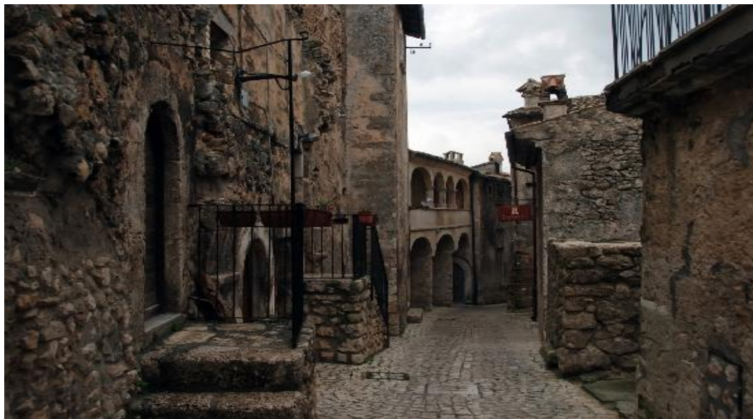
The medieval village of Santo Stefano di Sessanio