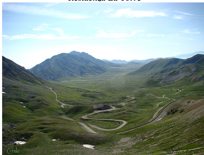
Campo Imperatore: paradise!