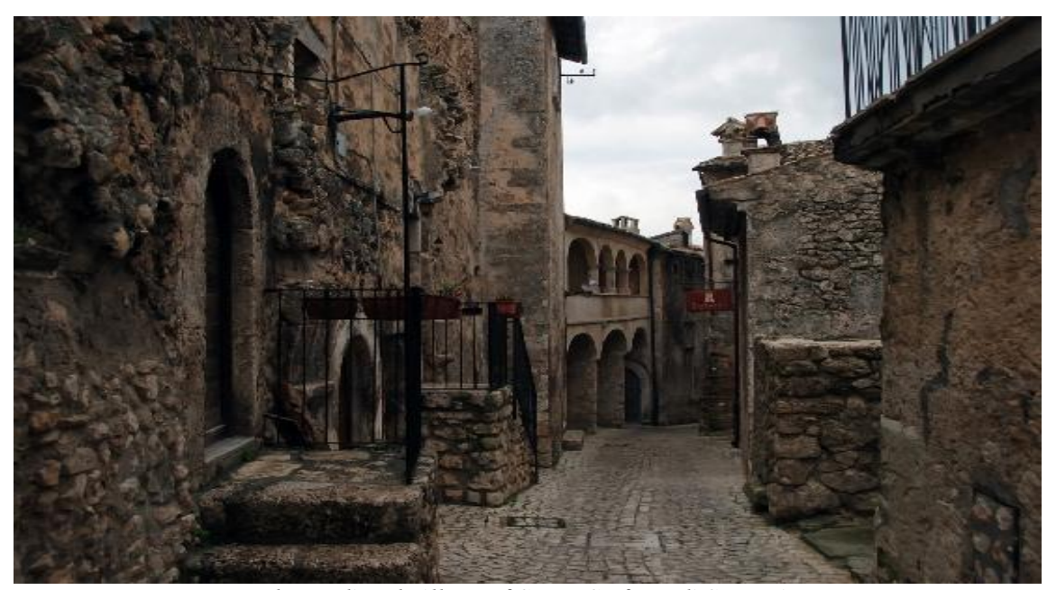
The medieval village of Santo Stefano di Sessanio