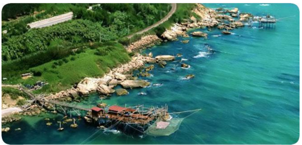
Cruising along La Costa dei Trabocchi