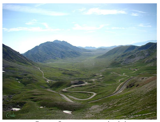
Campo Imperatore: majestic!